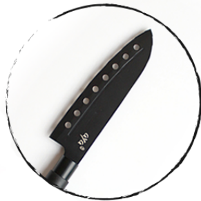
1 SUSHI KNIFE